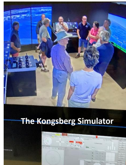
The Kongsberg Simulator

The staff were understandably very enthusiastic and were happy to go into whatever detail we required. The