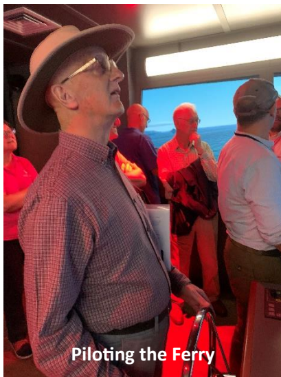
Piloting the Ferry

After the tour of the pool, we were taken into two live ship bridge simulators and given the opportunity to navigate a ferry and fast watercraft (Kongsberg Simulator) in various sea