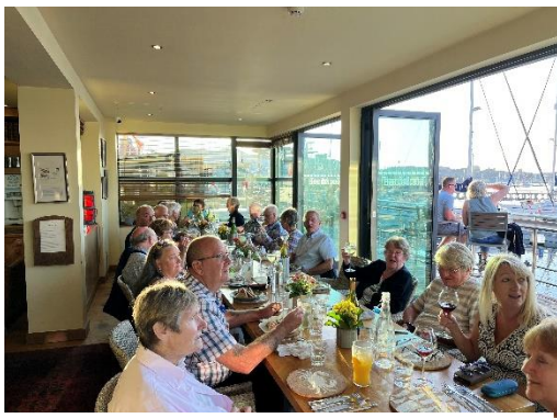
At The Bridge Restaurant