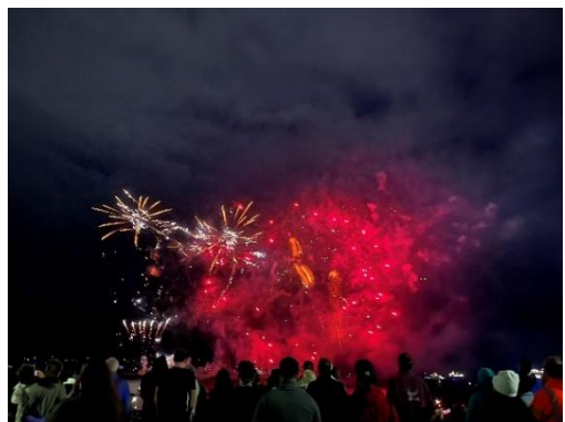
Taken from the Terrace of the Ocean View at the Dome restaurant