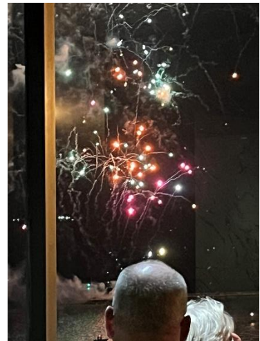
Taken from the tables in the Ocean View Restaurant in the Dome